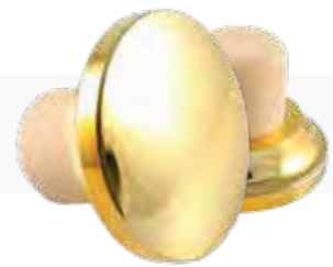
CUSTOM METAL EFFECT