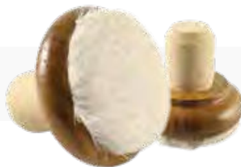
FULL CUSTOM MILLED